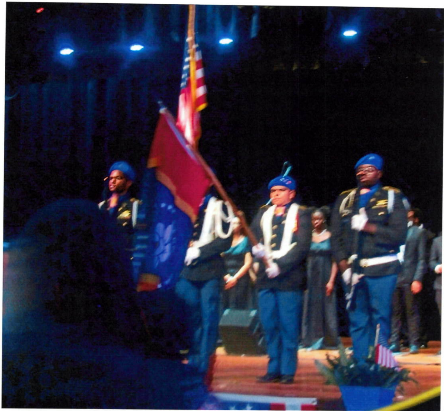
MURRAH HIGH SCHOOL JROTC VETERANS DAY PROGRAM 2024