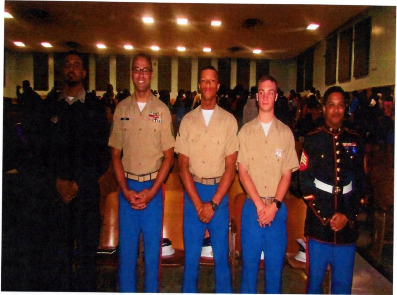
Murrah High School JROTC Veterans Day Program 2024 Guests