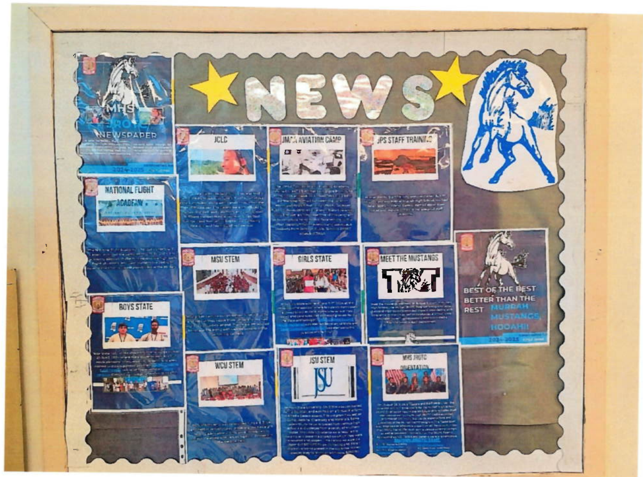
INFORMATION DISPLAY BOARD