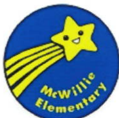
McWillie Elementary About Montessori Program