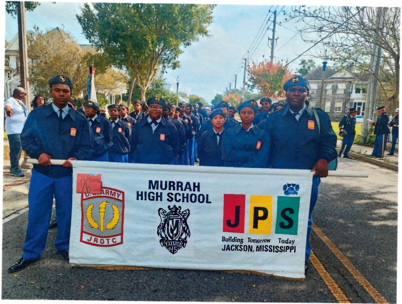
Biloxi, MS Veterans Day Parade 2024